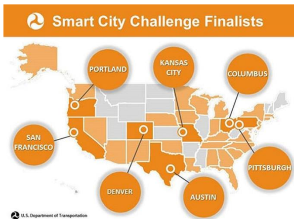
Figure 2: Finalist Cities in the Smart City Challenge 21

Beyond its size, the Smart City Challenge’s most substantial innovation was its ability to bring in corporate and philanthropic contributions. The seven finalists collectively received pledges for